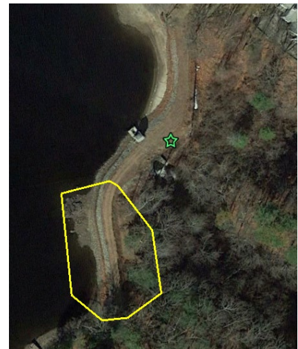
Figure 1: Area of Proposed Evaluation

Pare understands that the area of interest is located at the Main Dam along approximately 150 feet of the embankment at the right end of the dam. Based upon conditions reported in previous inspection reports as well as those reviewed during the preparation of this scope of work, possible seepage is present at the downstream toe of the 6-foot high embankment in this area; the elevation of the seepage breakout appears slightly below normal pool elevations. Seepage is also present at the downstream toe of the apparently natural slope beyond the tree line in this area;